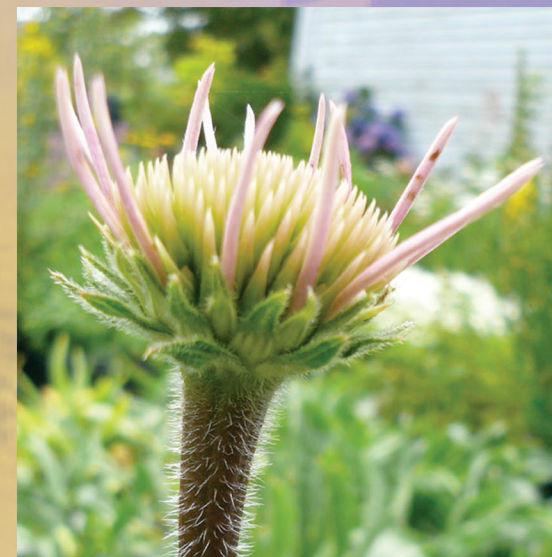
Echinacea angustifolia: medicinal coneflower