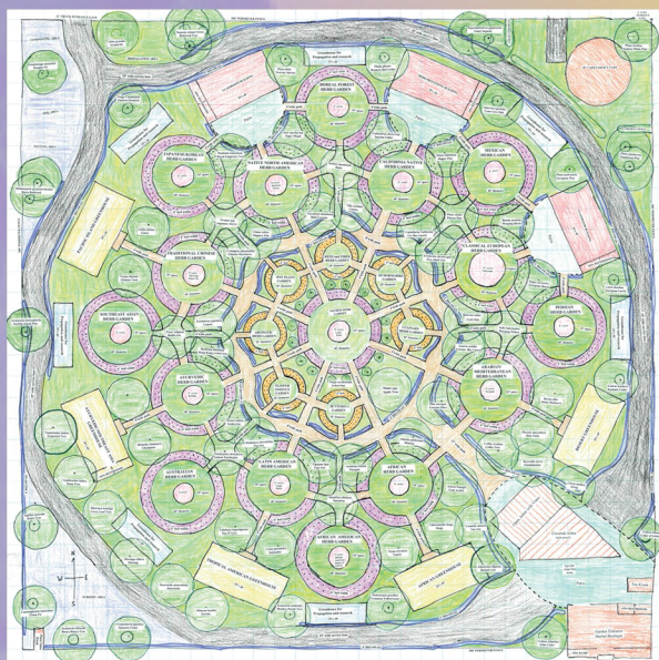
Proposed garden design. See website for greater detail.

It covers the full spectrum of herbs used in all the known healing modalities: physical and physiological, psychological and spiritual; and in the forms of plant parts, poultices, teas, tinctures, decoctions, ointments, essential oils, flower essences, fumigants, and homeopathic micro-doses.